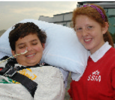
Cincinnati Tri-State to St. Junes